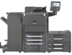
Shown with standard 270 sheet DSDP, optional 500 x 2 sheet paper trays, 500 sheet multi-purpose tray, and 4,000 sheet finisher