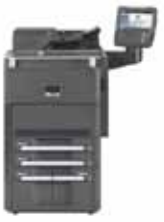
Shown with standard 270 sheet DSDP