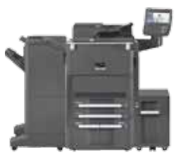
Shown with standard 270 sheet DSDP, optional 3,000 sheet side LCT and 4,000 sheet finisher