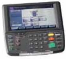
Newly designed, easy-to-use large color touch screen control panel