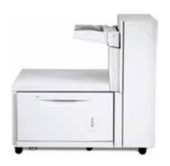
Oversized High-Capacity Feeder