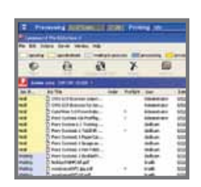
EFI Fiery Bustled Controller

Creo® Spire™ Color Server—This color server is available in both attached and standalone versions and lets you easily perform everything from preflight checks to proofing, imposition to short-run production and much more. Excellent profiling options let you see what your document will look like at each printing stage, and proofing couldn't be faster or easier. Available upgrades include the Professional Kit and a control station.