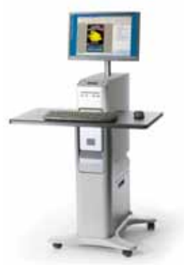
EFI Fiery Color Server