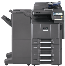
Shown with optional 175 sheet DSDP, 500 x 2 sheet paper trays and 4,000 sheet finisher