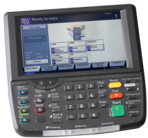
Newly designed, easy-to-use large color touch screen control panel