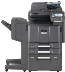
Shown with optional 175 sheet DSDP, 1,500 x 2 sheet paper trays and 1,000 sheet finisher